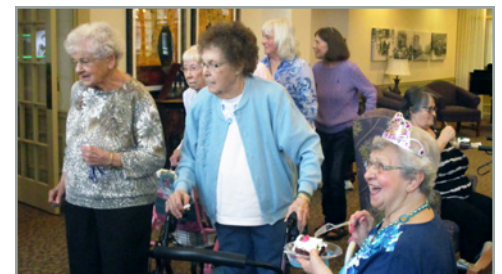
Folks enjoying the Birthday Party.