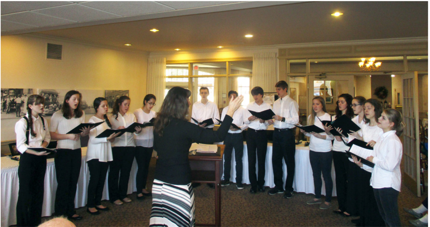
▲ Christian Educators Home School of Goshen - Choir