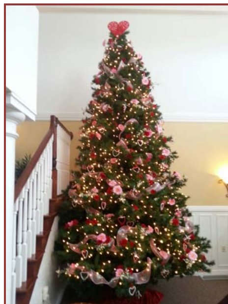
Valentine Tree--stop in to see our beautiful tree!

'Of course,' said the grandmother. 'Why, just name me one thing that's prettier than freckles.' The little girl peered into the old woman's smiling face. 'Wrinkles,' she answered softly.