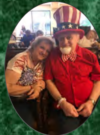
Independence Day!! 2017