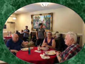
Annual BBQ Party