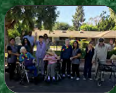
Balboa Park Visit Day!!