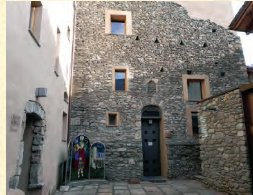
Some think Anselm was born in this house in Gressan. It's possible that his family owned two houses.