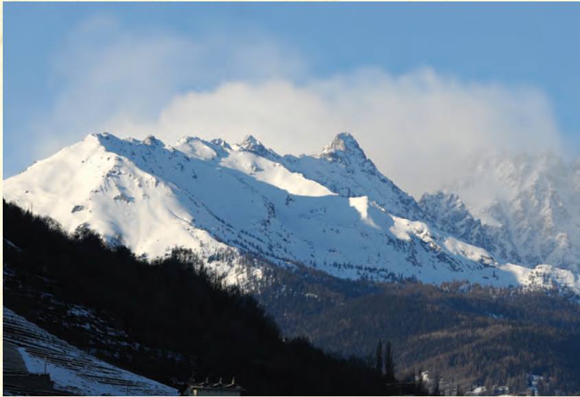
A view of the Alps from Aosta

Aosta is an ancient town that today is near the border between Italy and France. The border is marked by a chain of very high mountains called the Alps. The Alps are so close to Aosta that Anselm could see them everywhere he went. As a child, he stared at them with amazement. They were high and powerful and always capped with shining snow, so he was sure God lived there. Once, he dreamed he was able to climb to the top of one of