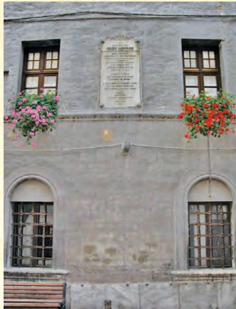
Many believe Anselm was born in this house in Aosta.