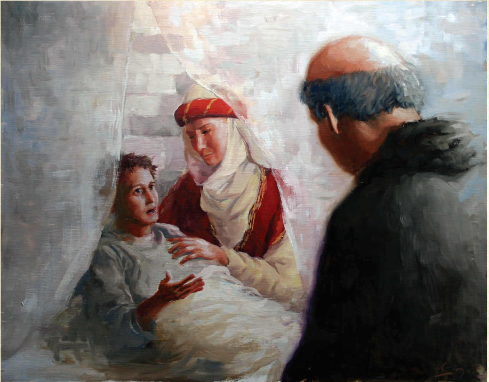
Anselm tried to get sick to convince the abbot to take him as a monk.