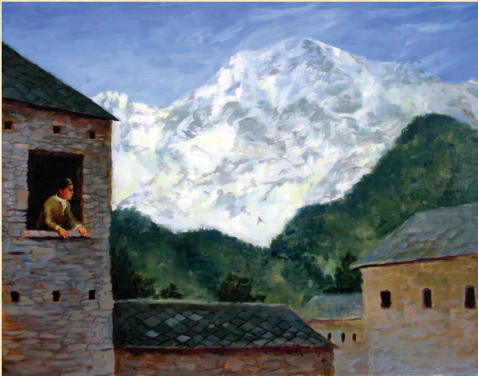
As a child, Anselm stared at the mountains with amazement.