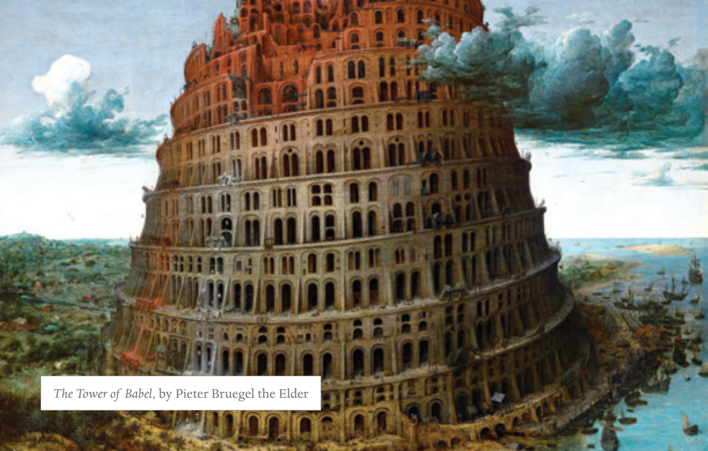
The Tower of Babel, by Pieter Bruegel the Elder

population. 1 For comparison's sake, World War II was the most devastating war in the last 200 years. The nations involved in that great war lost about 80 million people, or 3.5% of their population, due to casualties in combat, along with war-related diseases and famine. 2