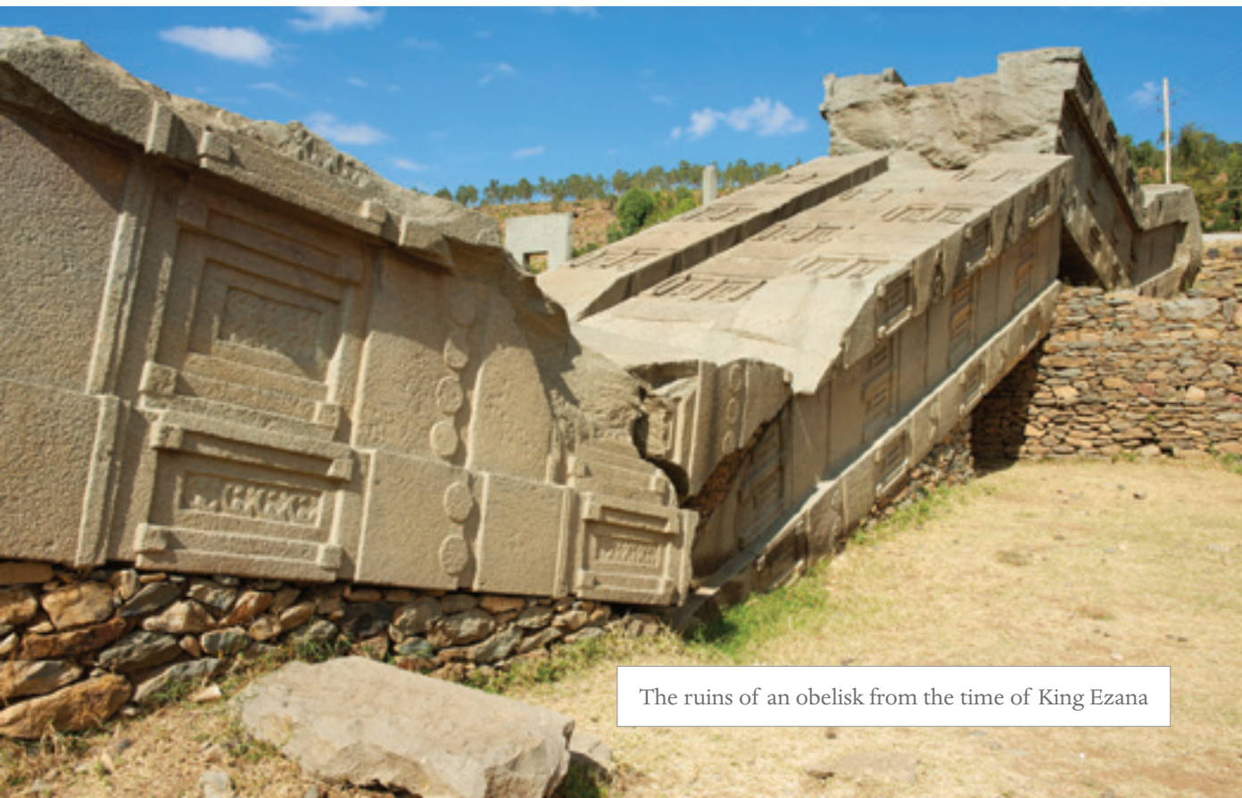
The ruins of an obelisk from the time of King Ezana

The kingdoms of men are often formed when an Alexander the Great or Julius Caesar rides into the cities on a white horse. They conquer with bloodshed and military might. Jesus, however, routinely takes a different approach. His kingdom is sometimes formed by slave boys brought into the nation through a back door. It is often through weakness and suffering that His kingdom comes.