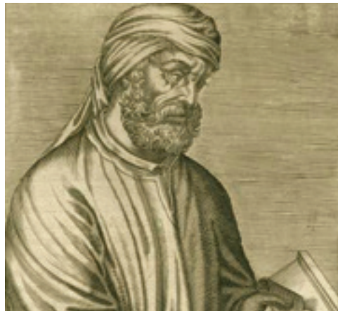
Tertullian of Carthage

“Then Jesus said to His disciples, “If anyone desires to come after Me, let him deny himself, and take up his cross, and follow Me. For whoever desires to save his life will lose it, but whoever loses his life for My sake will find it.” (Matt. 16:24-25)