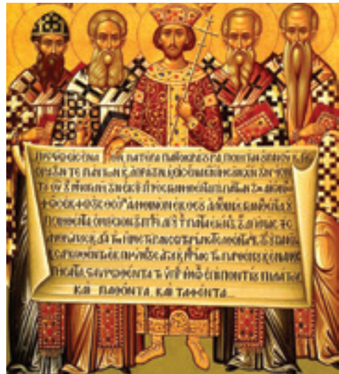
The Emperor Constantine at the Council of Nicaea