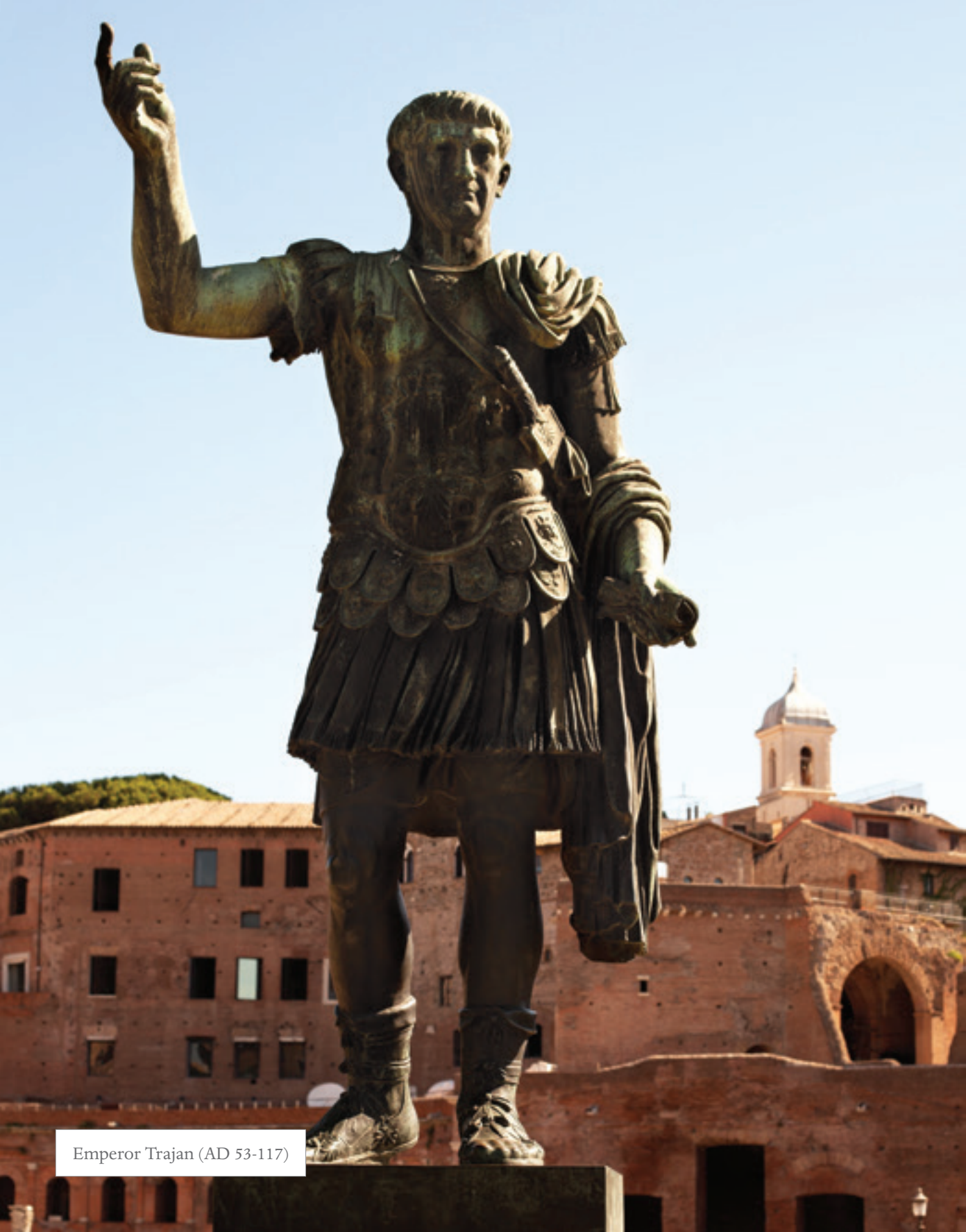
Emperor Trajan (AD 53-117)