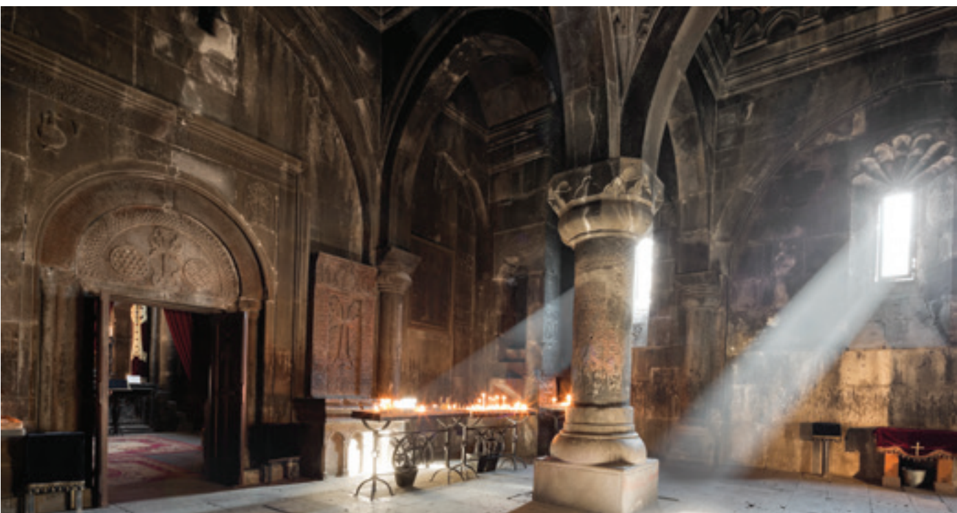
There are still many Armenian churches standing from early centuries of the Christian church.

King Tiridates destroyed the temple of Anahit in the capital city of Artaxatar, against the protests of the pagan priests, and declared Armenia to be a Christian nation, distinguishing this land as the first country of any size to become an officially Christian realm. The king also began to actively work with Gregory to spread the Gospel throughout Armenia. Gregory preached from one end of the nation to the other in the Armenian language, and it was not long before nearly the whole nation was converted to Jesus Christ.