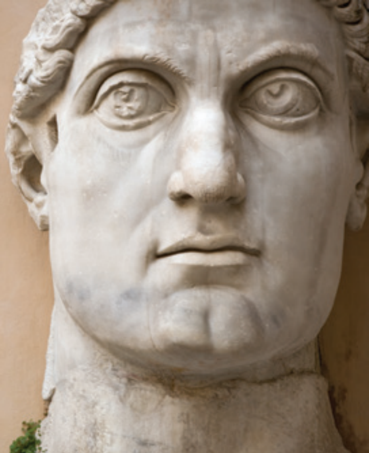
Bust of the Emperor Constantine

Some believe that Constantine took on the faith for political purposes, but it is hard to believe that to be the case, given that an estimated 90% of the population was still aligned with paganism. Nonetheless, Constantine's active support of Christianity was a strong indication that the faith was no longer some obscure cult