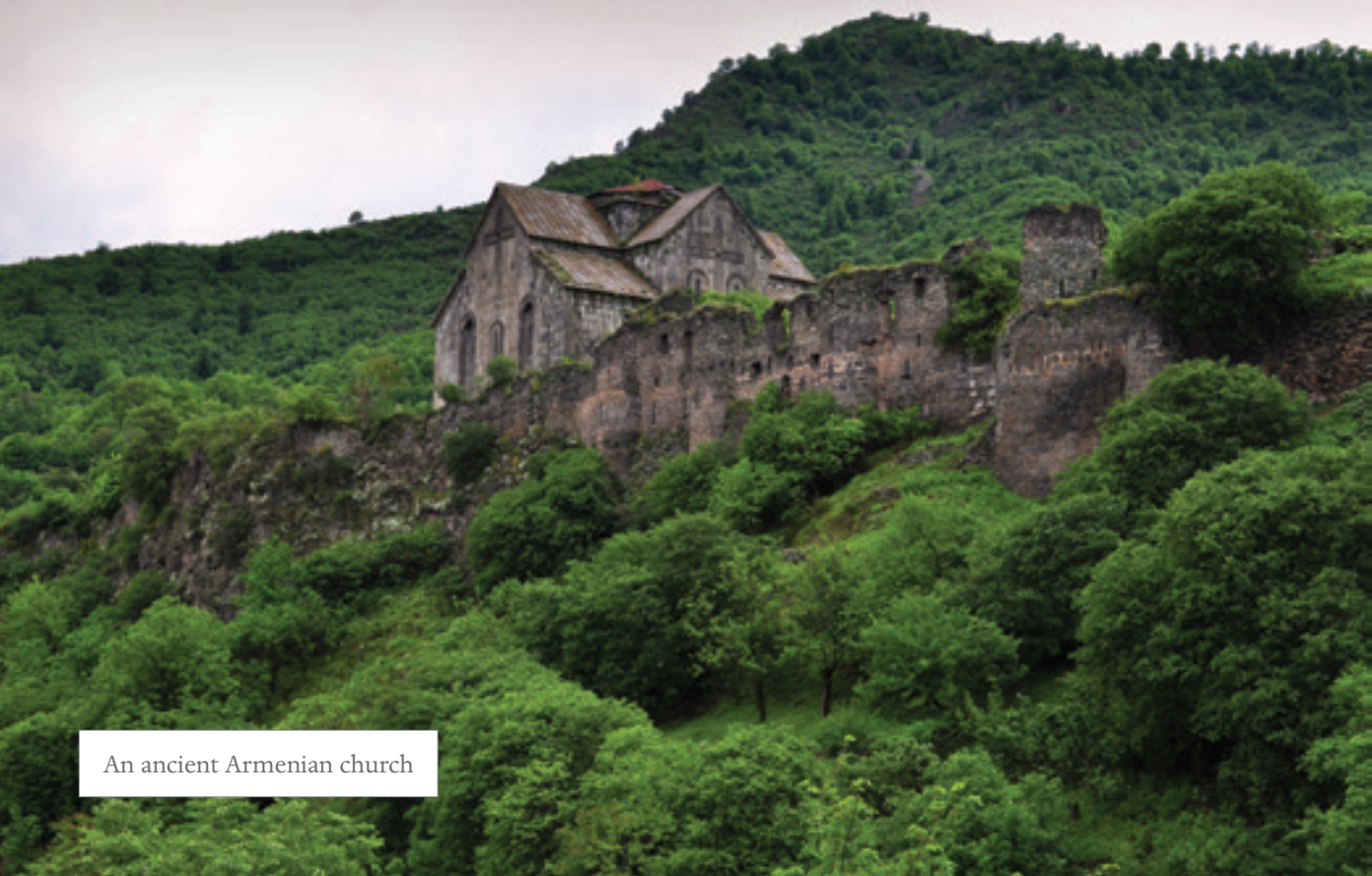
An ancient Armenian church