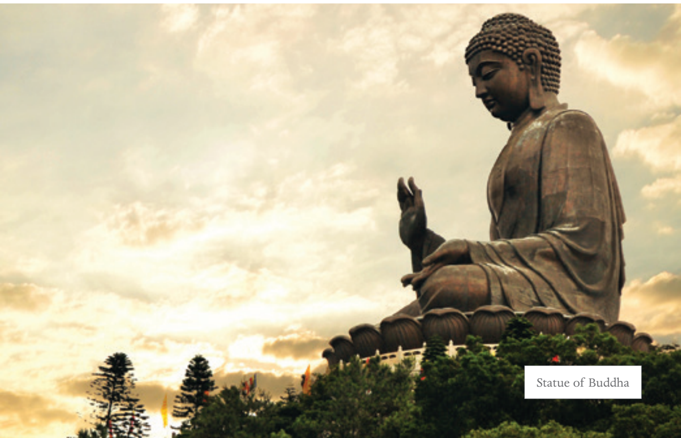
Statue of Buddha

The Buddhist religion is centered around the idea of suffering. Regrettably, Buddhism does not admit the cause of suffering to be sin against God. Instead, this religion teaches that desiring things is the cause of suffering. They try to fix man's problems by just meditating or thinking and by good moral conduct.