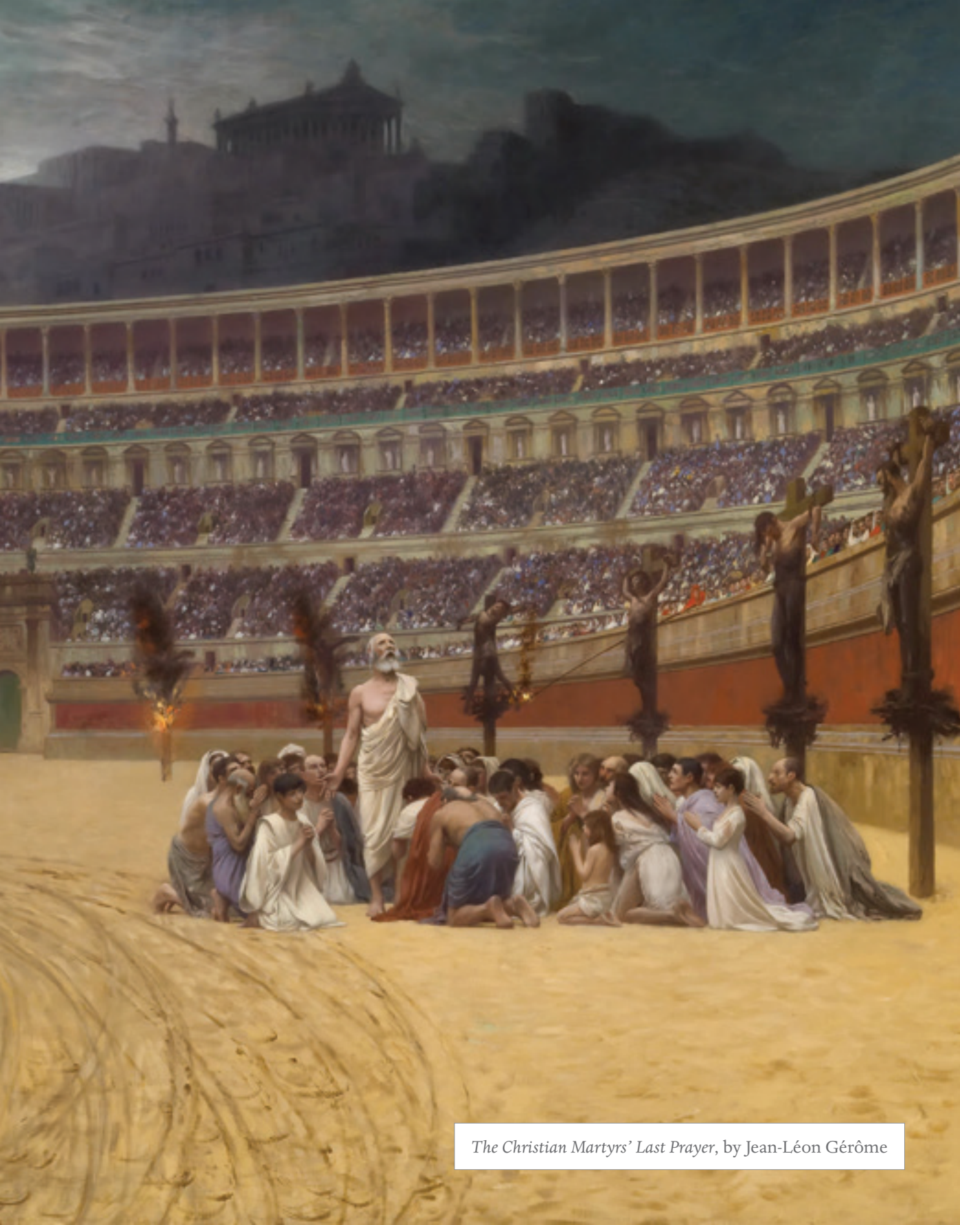
The Christian Martyrs' Last Prayer , by Jean-Léon Gérôme