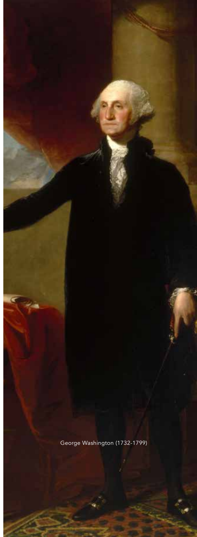
George Washington (1732-1799)

Rousseau is a true socialist at heart. Some humanists want to turn individual man into a god. Others will turn “the people” into god, especially by making the state too powerful. Although Rousseau is tempted towards the first option, he settles for the second because he would rather worship corporate man. At the end of all of the fancy rhetoric, Rousseau settles on the state as god, limiting individual liberties. Of course, he also had to reject family and church community as important elements of the human social system. And as with many of the Enlightenment men, he held marriage in low esteem and never wed.