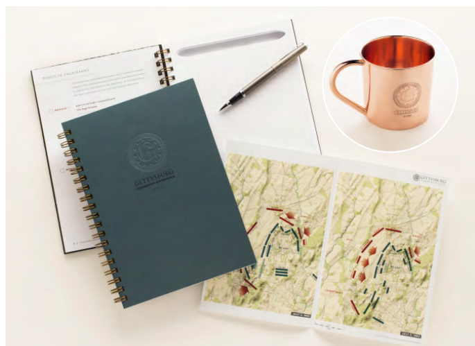
Each participant receives a journal, maps, souvenir mug and pin designed specifically for their Leadership Experience at Gettysburg.

A key distinction of the Leadership Experiences at Gettysburg is the depth and breadth of our faculty's knowledge and their passion for developing new leaders. Instructors are chosen for each session based upon the identified goals and learning objectives of the group. Licensed Battlefield Guides connect historic leadership lessons to each session. Insights are strong and the impact lasts.