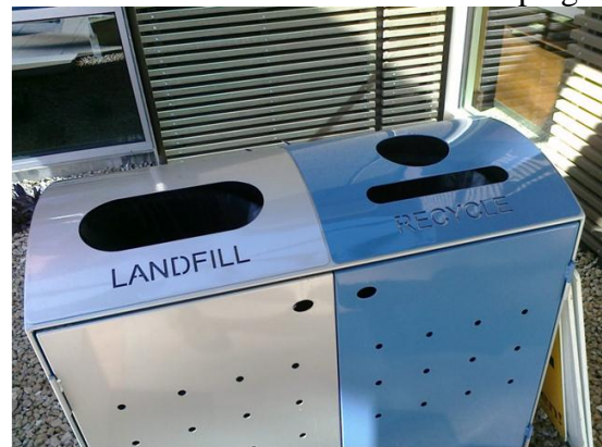
Fig. 2 Landfill vs Recycle Waste Bins / ASU Tempe