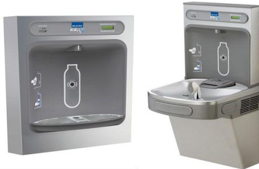
Fig. 1 Water Bottle Filling Station Models / Tempe UHSD