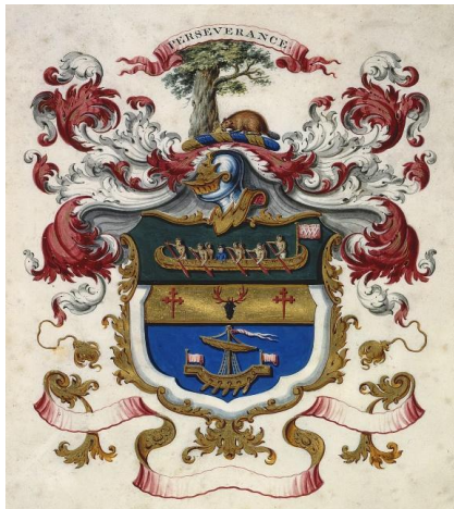
North West Company coat of arms, ca. 1800–1820. Unknown Artist, Library and Archives Canada, C-008711.

PRODUCTS: Fur trade, General Store, Department Store, 86 Canadian locations.