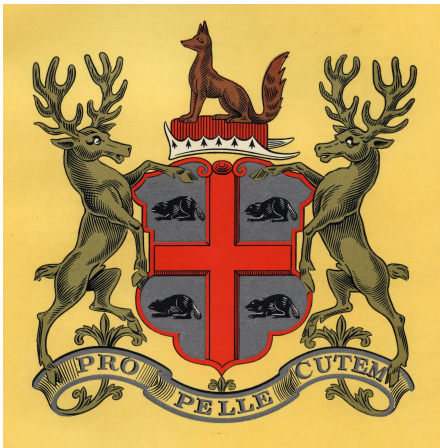
HBC Coat of Arms, 1952. HBC Corporate Collection.