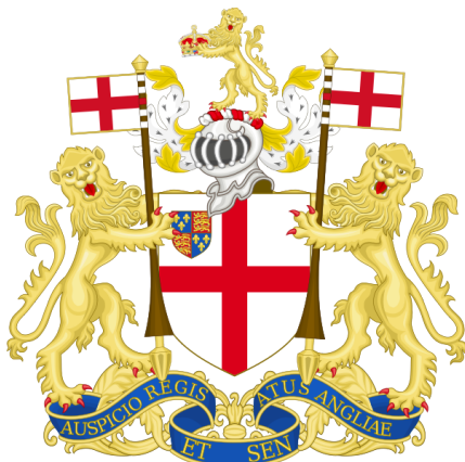
East India Company coat of arms, Wikimedia Commons.