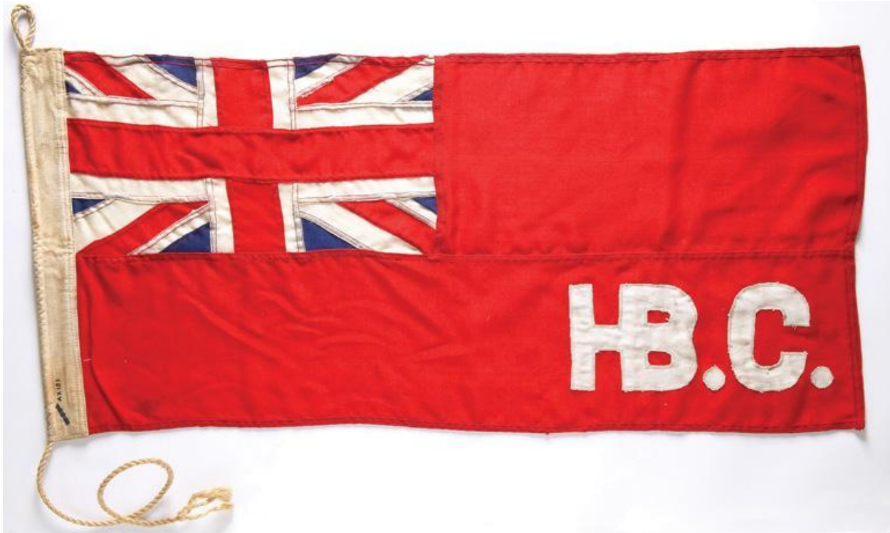
HBC Red Ensign Flag. HBC Corporate Collection.