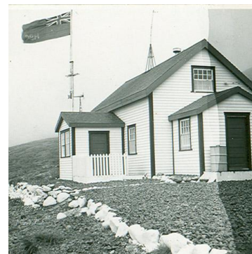
The Corporate Flag, the Governors Standard Flag, and the Red Ensign Flag. HBC Corporate Collection.