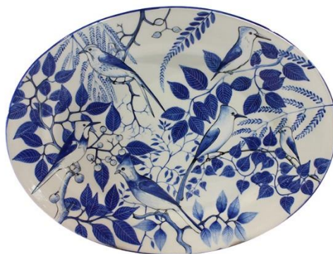
An Oval Platter in blue and white birds and two lamps and a dinner plate in black and white Birds.

Then there's the Birds. They wake us in the morning and again in the early evening. In the garden we watch them feed and preen and play, because of this, birds are part of our homes and lifestyle. Birds were intended for the classic blue and white theme, but when a customer commissioned them to be done in black and white, we thought it worked well.