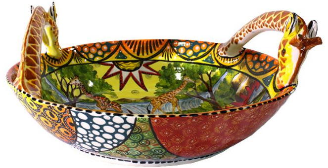
Giraffe Handle Tray