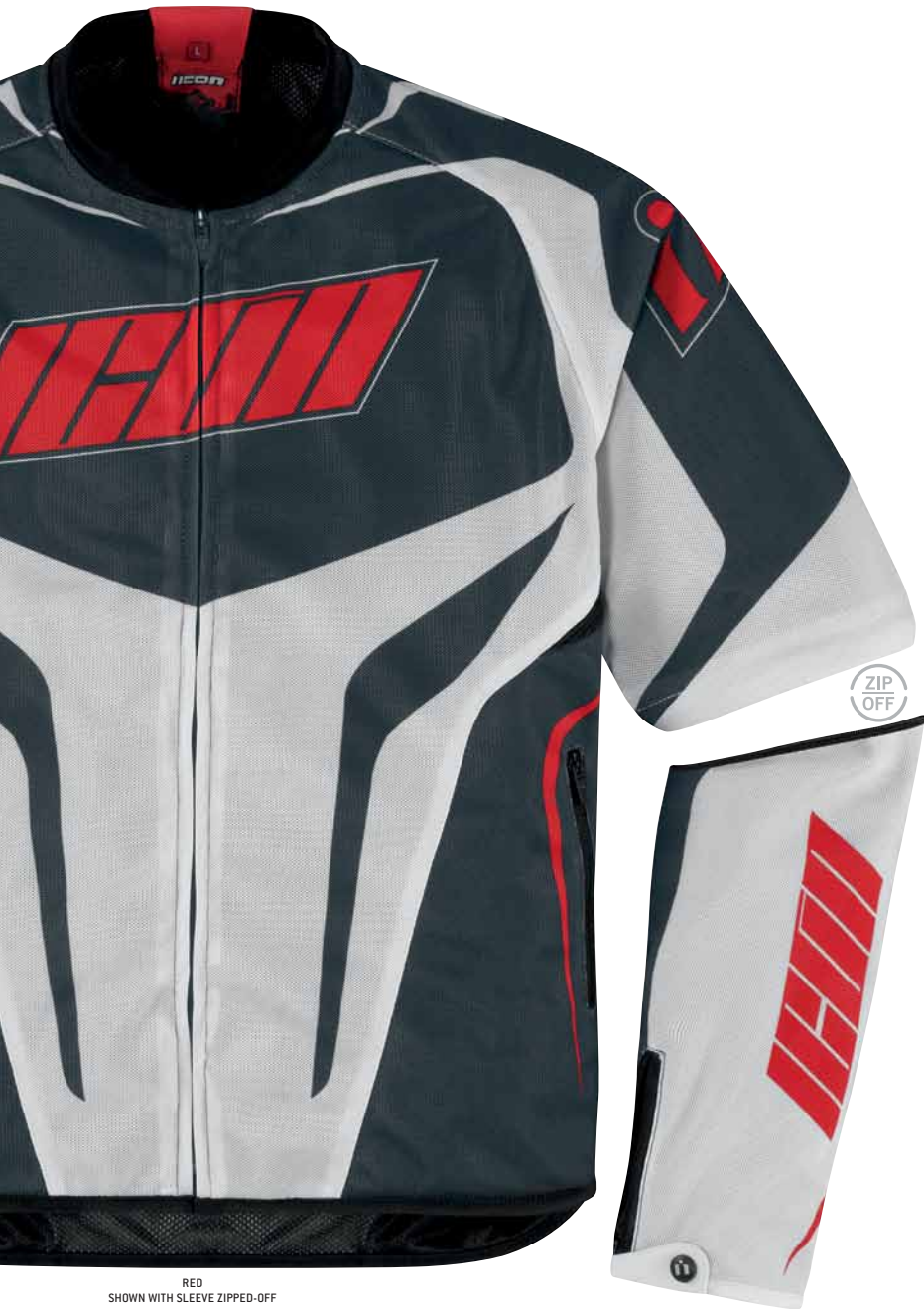
RED SHOWN WITH SLEEVE ZIPPED-OFF