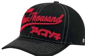
LONG TIME™ HAT Black / $25