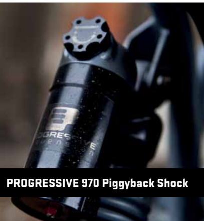
PROGRESSIVE 970 Piggyback Shock

The Quartermaster is a URAL x ICON collaborative project designed to increase the long distance off-road capacity of the URAL Solo. Devoid of the sidecar found on most URALS, the Quartermaster was a single-track beast of burden. Extensive frame modifications, including an oversized backbone, braced headstock, and high clearance subframe, differentiated the Quartermaster from her stable mates. Reinforced swingarm, long-travel suspension, and knobbed tires provided a surefooted stance when the road ended. The oversized fuel tank, fitted with frisco'd feed lines, made available every ounce of fuel for maximum operational range. Custom skid plate, crash hoops, and high-mount fenders all spoke to her mastery of the unimproved path. Lathered in haze grey from stem to stern, she would survive where so many others had fallen. Ironically, the Containment Conflicts had turned The Quartermaster's workaday looks and antiquated performance specs into the most desirable traits of beauty. Time has a way of evening things out. Check out the video at: RIDEICON.com/Quartermaster