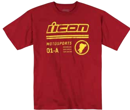
FLYRYTE™ TEE Red / $25