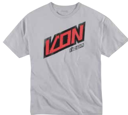
AXIZ™ TEE Grey / $20