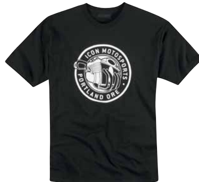
SLABSIDE™ TEE Black / $20