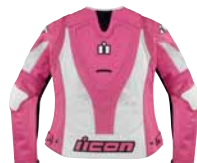
PINK BACK VIEW