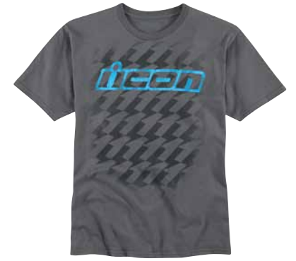
SLANTY TOWN™ TEE Grey / $25