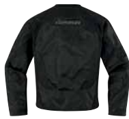
STEALTH BACK VIEW