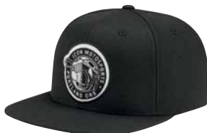
SLABSIDE™ HAT Black / $20