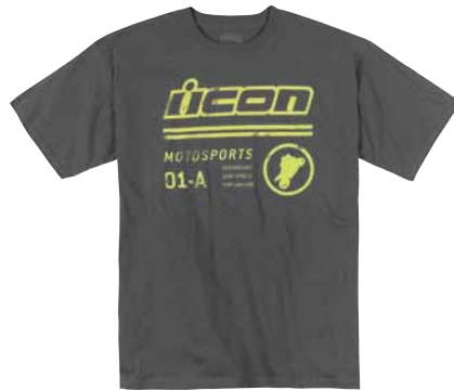
FLYRYTE™ TEE Grey / $25