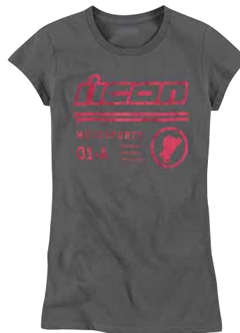
WOMENS FLYRYTE™ TEE Charcoal / $25