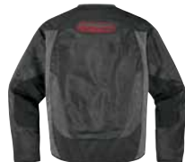
GREY BACK VIEW