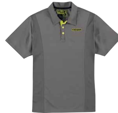
VILLEN™ POLO Gunmetal / $35