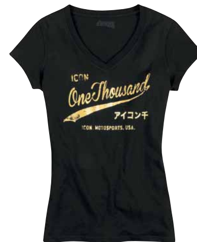
WOMENS GOLD TIMES™ TEE Black / $30