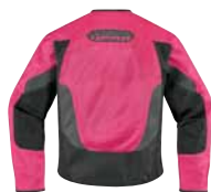
PINK BACK VIEW