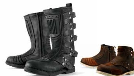
ELSINORE / BLACK

The Elsinore's™ five-strap alloy buckle chassis, stamped metal heel plate, and internal steel shank combine for a serious dose of moto-x homage. The traditional Goodyear™ welt construction mates the street-specific sole to the magnificent leather upper. A zippered medial entry zipper, borrowed from Paratrooper jump boots, is the only luxury the Elsinore will allow itself. The El Bajo shares almost all the attributes of the Elsinore, just in a shorter two buckle silhouette. Old-school MX reinterpreted for the urban sprawl.