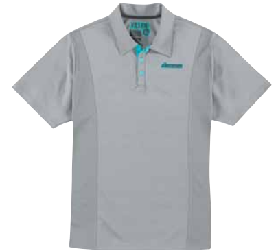
VILLEN™ POLO Grey / $35