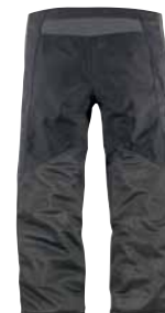
GREY BACK VIEW