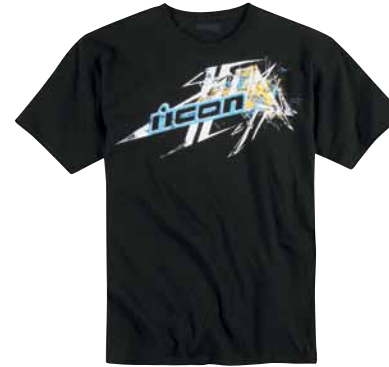
GRIM PICKENS™ TEE Black / $25