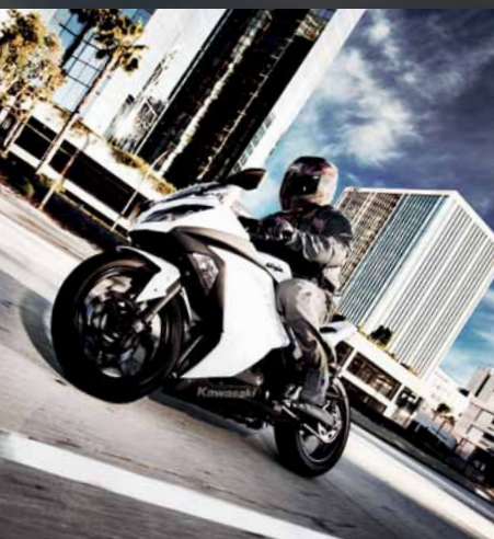
Jason Britton performing a proper stand-up wheelie aboard a bone stock 2013 Ninja 300.

Cues such as a soft suspension and brakes hint at the bike's more beginner-friendly roots, but this is still a bike with capabilities that outstrip its spec sheet. A 600cc bike will always be the tool of choice, but the Ninja 300 allows most of the capability and presence, in a more accessible package. Silence the critics with how you ride, not what you ride.