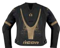
BLACK BACK VIEW