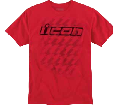
SLANTY TOWN™ TEE Red / $25