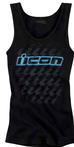
WOMENS SLANTY TOWN™ TANK Black / $25