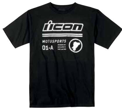
FLYRYTE™ TEE Black / $25