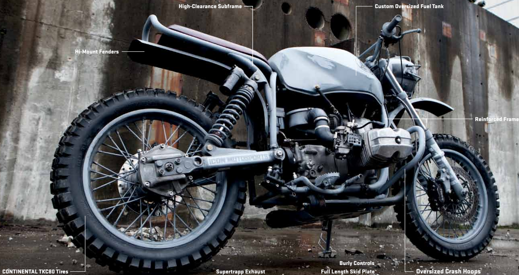
PIAA RS800 Lamp with Custom Cage