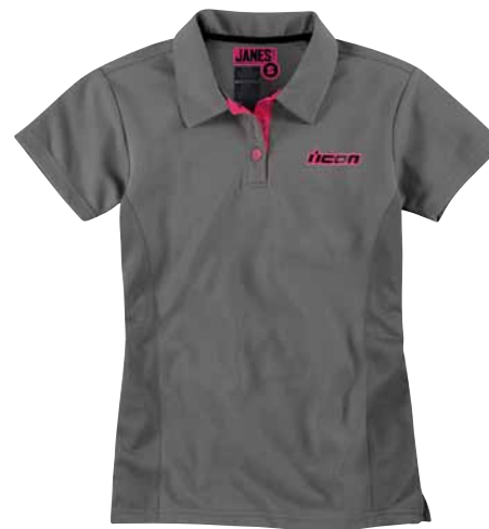
WOMENS JANES™ POLO Gunmetal / $35