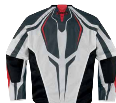
RED BACK VIEW

FIGHTER MESH CHASSIS // ZIP-OFF SLEEVES // REINFORCED ELBOWS // RELAXED FIT // REMOVABLE CE ARMOR