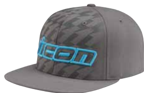
STACK™ HAT Grey / $20