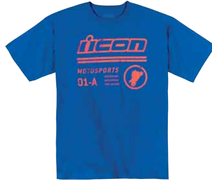
FLYRYTE™ TEE Blue / $25