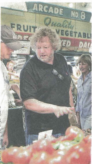
SEATTLE Chef Tom Douglas recently bought a $1.175 million apartment near Pike Place Market.

The couple's 4,200-square-foot Arts and Crafts-style home, built in 2007, is in Healdsburg, Calif., near Napa and Sonoma wineries and renowned restaurants such Please turn to page M8