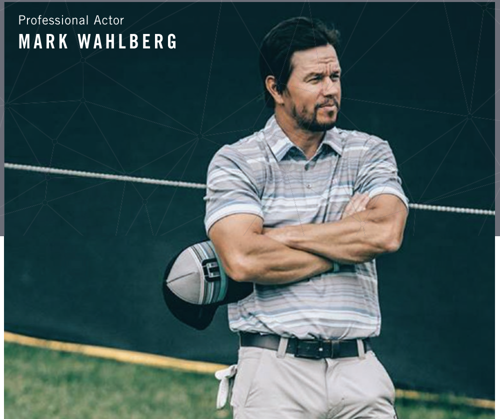
Professional Actor MARK WAHLBERG