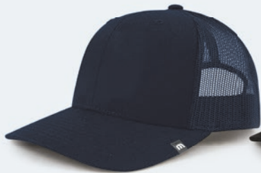
4DBL | Dark Blue