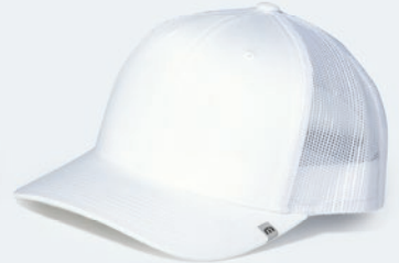
1WHT | White