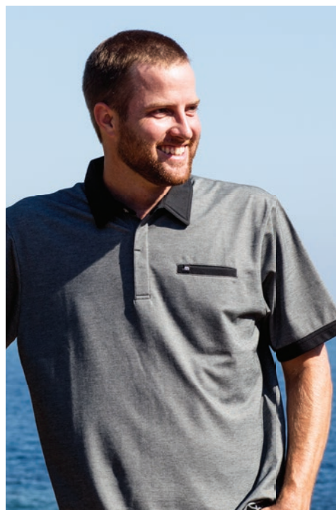
PGA Tour Professional CHRIS KIRK