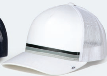
1WHT | White