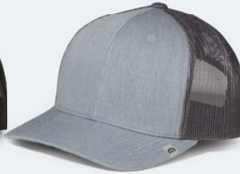
9HGR | Heather Grey