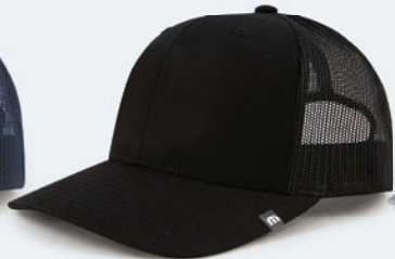
0BLK | Black