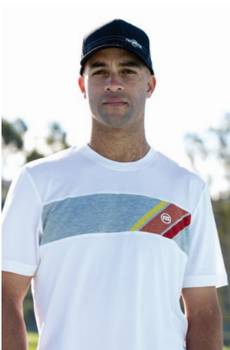
ATP Tour Professional JAMES BLAKE