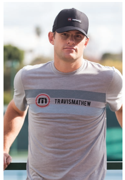
ATP Tour Professional ANDY RODDICK