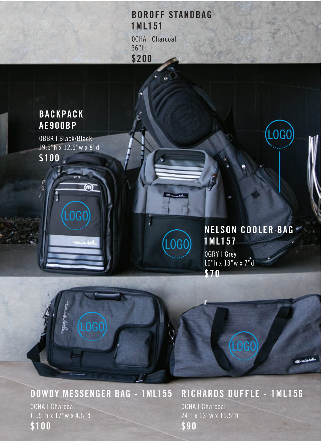
BOROFF STANDBAG 1ML151 OCHA | Charcoal 36"h $200