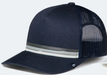
4NAV | Navy