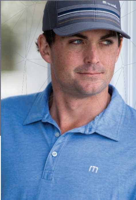
PGA Tour Professional KEEGAN BRADLEY