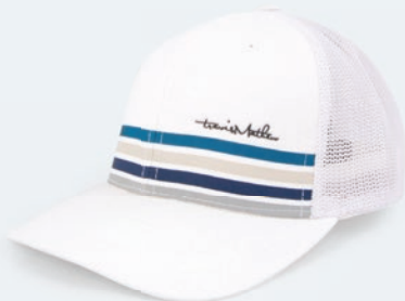
1WHT | White