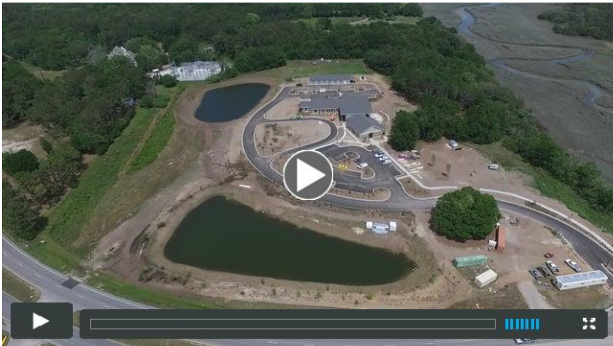
Kiawah Island Municipal Center Construction Video 22 Expected Completion: Mid July