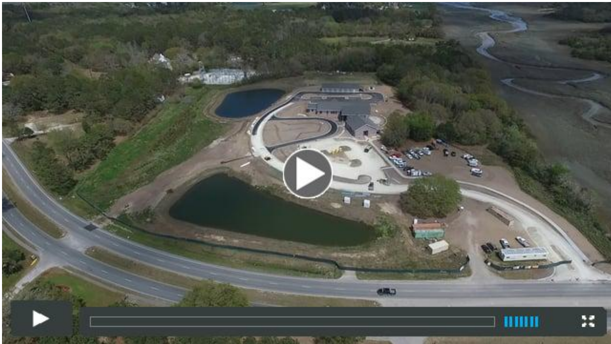
Kiawah Island Municipal Center Construction

Check out the latest aerial footage from the Municipal Center Construction. The expected completion date is July 2017.