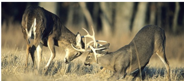
White-tailed Deer Density (per square mile) on Kiawah Island

The management of the deer herd on Kiawah Island is an ongoing process in which many management techniques are discussed and evaluated. A wealth of information has been gathered during the last ten years which will allow wildlife professionals to continually determine the best deer management practices for the island.