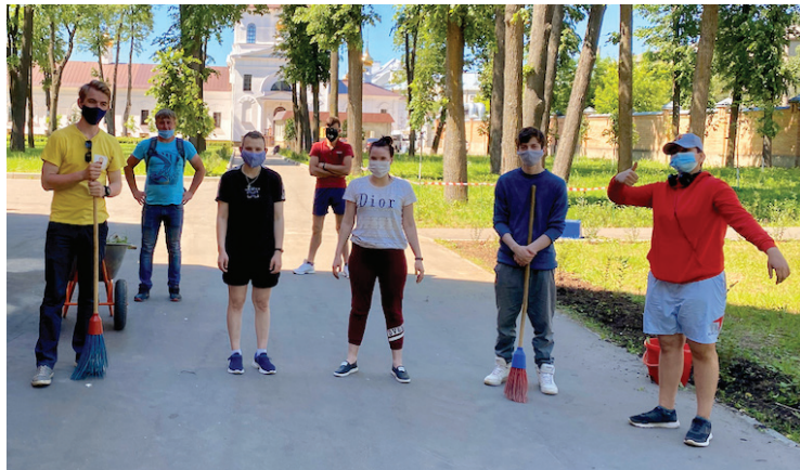
Volunteering to clean up a local church