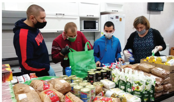
Packing food for orphans in need

• Many of the single grads are confined to small apartments with several grads to a single room flat. Many have lost their jobs. Our staff is making sure that they don't turn to alcohol or drugs during this time and encouraging them to trust the Lord to see them through.