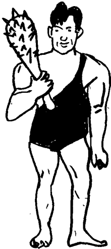
DEACON'S NEW FIND