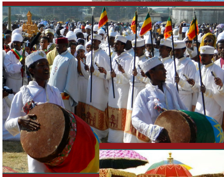
Various pictures of the Timket celebration. Timket is the Ethiopian Orthodox celebration of the Epiphany where the baptism of Jesus is lifted up.