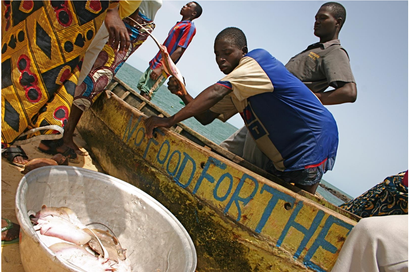
A fisherman unloads his catch in Sierra Leone

"Who are the ones who are really going to pay the price? Poor, developing countries in the tropical zone," he said in an interview at his UBC office.