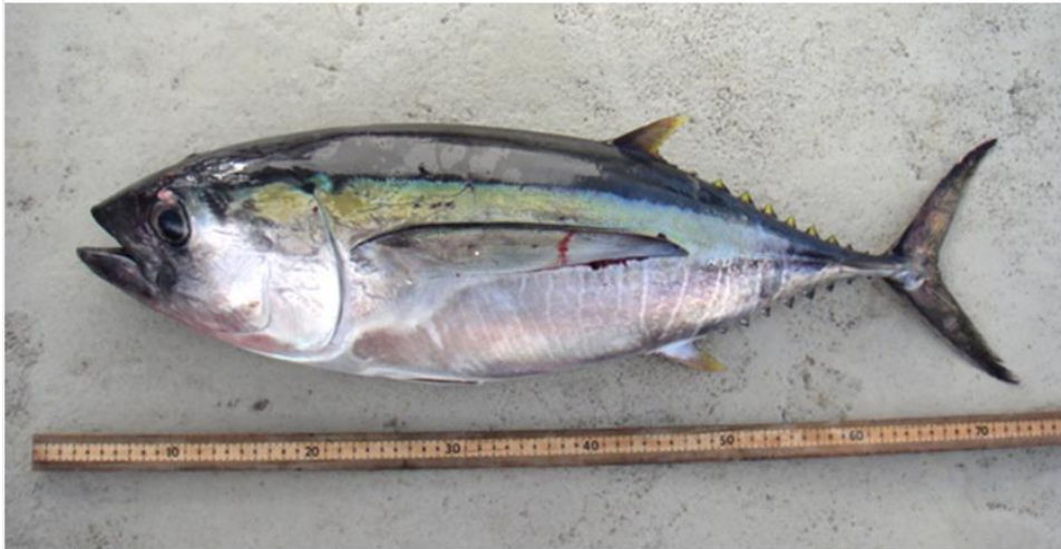
Measuring a bigeye tuna.