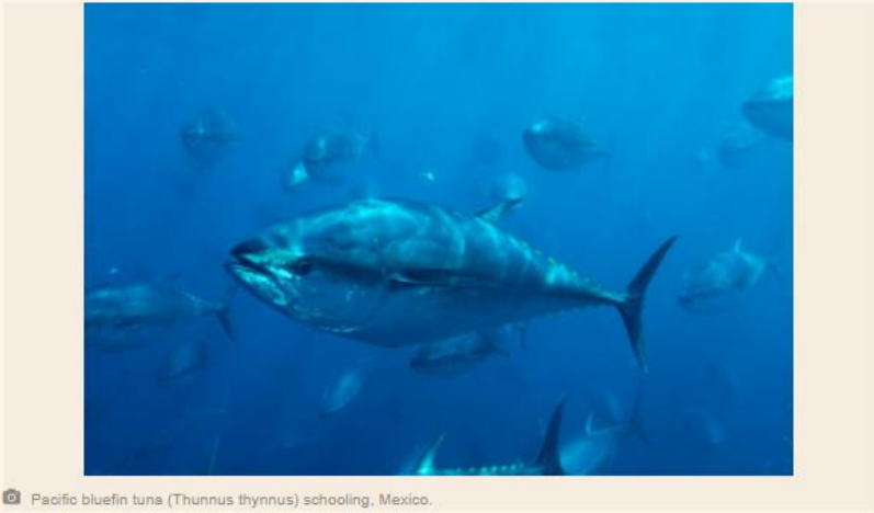
Pacific bluefin tuna ( Thunnus thynnus ) schooling, Mexico.

By Undercurrent News Aug. 28, 2017 17:43 BST