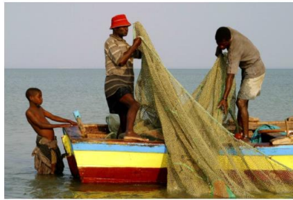
Fishers on boat preparing their nets in Mozambique.

WRITTEN BY Alastair Bland PUBLISHED ON Feb. 20, 2018 READ TIME Approx. 5 minutes