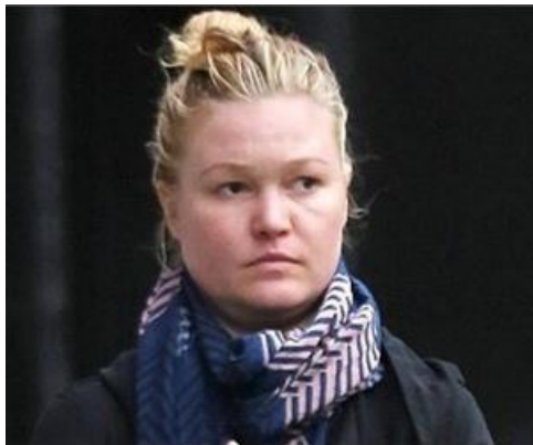
10 Broke Celebrities Now Working Normal Jobs