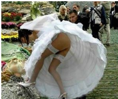
Husband Shares Wedding Night Photos After Divorce