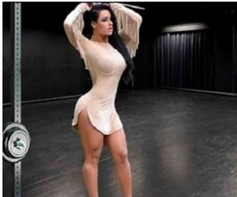
Gym Photos That You Cannot Unsee [PICS]

Solar Panels Needed To Mitigate Climate Change