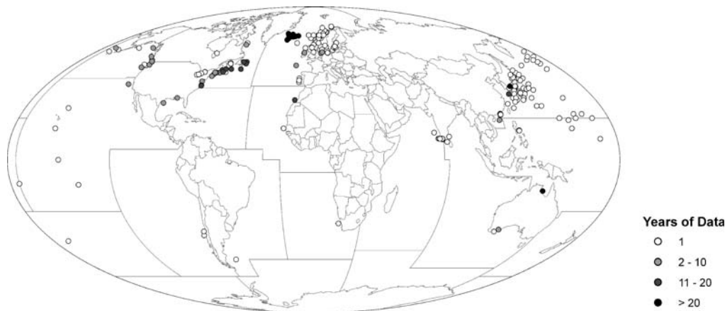
Figure 1. Distribution of case studies from which fisheries-specific estimates of fuel use intensity were derived, covering most of the major fisheries of the world. The straight lines cutting ocean basins demarcate the 18 statistical areas used by the FAO to report on global marine fisheries catches, and used here for geographic stratification.

for most of humanity, seafood remains an important source of animal protein (25). Consequently, the most meaningful basis upon which to compare fisheries with other food-producing sectors is in terms of their edible-protein yield (9–12). We therefore quantified the edible-protein energy efficiency of global fisheries by dividing the maximum edible-protein energy that could be derived from global catches in 2000 by the energy content of the fuel burned (26). The maximum edible-protein yield from catches in 2000 was estimated by first multiplying species-specific values for the maximum edible fraction of the animals landed, assumed to be equivalent to the muscle content of the animal (4, 27–29), by species-specific protein content of muscle values (1, 28–30). The resulting species-specific edible-protein fractions were multiplied then by corresponding catches in 2000, were summed, and then were converted to an energetic equivalent (4).