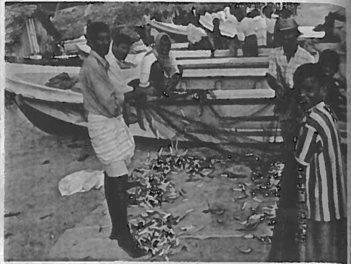
Small-scale fishers on the east coast of Sri Lanka sort the morning's catch.