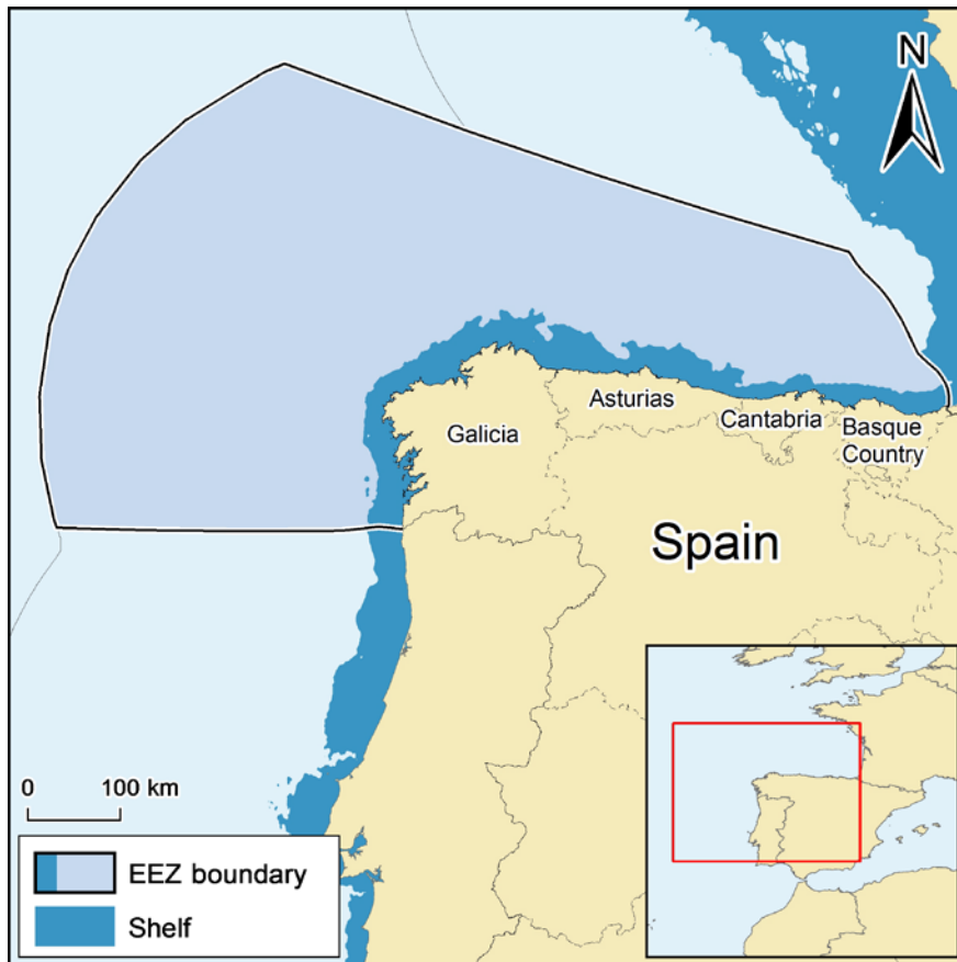
Figure 1. The Exclusive Economic Zone (EEZ) and shelf waters (to 200 m depth) of northwest Spain