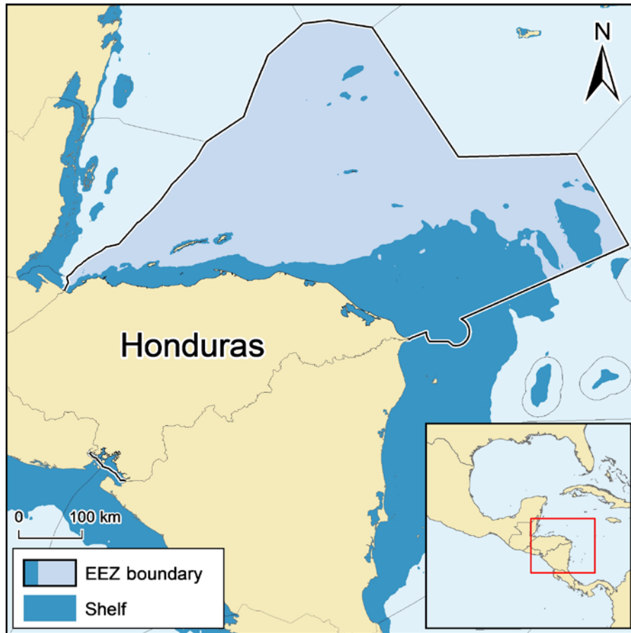
Figure 1. Map of the Exclusive Economic Zone (EEZ) of Honduras and its continental shelf. Note the very limited EEZ in Pacific waters.

On the Honduran Caribbean (Atlantic) coast lies the southern end of the Mesoamerican Barrier Reef System (Arrivillaga and Garcia 2004), boasting various mainland reef formations, mangroves, wetlands, sea grass beds and extensive fringing reefs around its offshore islands (Harborne 2001). On the Pacific coast of Honduras is the Fonseca Gulf, which contains 35% of Honduras' wetlands in addition to extensive mangrove forests (Soto et al. 2012). As a result of this habitat's variety, Honduras has a diverse and rich marine ecosystem, accounting for at least 500 species of fishes and over 125 different coral species (Humann and Deloach 2002), in addition to sea turtles and various marine mammals, all of which make Honduras a desirable place for tourism, divers, recreational fishers, and nature conservationists.