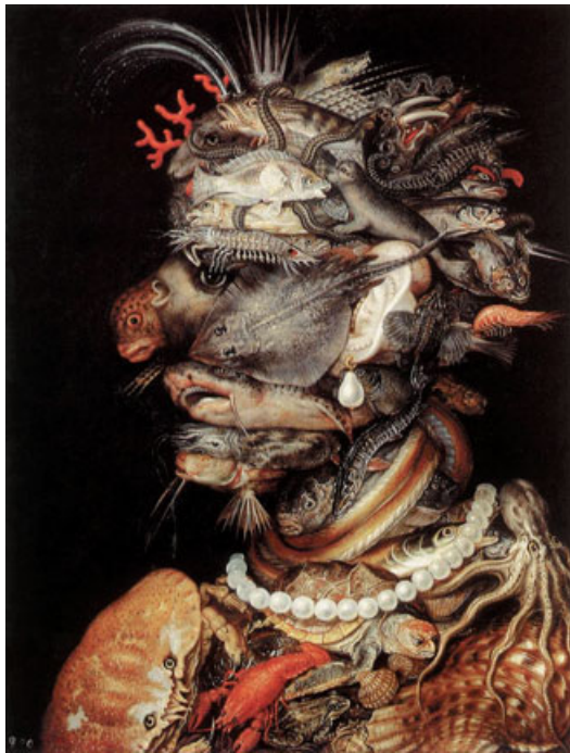
Figure 1 L'Acqua (The Water, 1566) by Giuseppe Arcimboldo (Italy, 1527–1593), oil on wood. Humans have used aquatic resources for centuries, and L'Acqua symbolizes the connection between marine life and our use of these resources. At the same time it illustrates the biodiversity of life in the sea, something potentially at risk from unsustainable fishing practices.

The Food and Agriculture Organization of the United Nations (FAO) has recently released a draft report which estimated as 7.3 million tonnes (t) the amount of fish (usually dead or dying) discarded annually by marine fisheries throughout the world (Kelleher 2004; Fig. 1). This estimate is considerably lower than previous estimates of 27 million t (reported range 17.9–39.5 million t), pertaining to the late 1980s/early 1990s (Alverson et al. 1994), and subsequently adjusted figures of 20–22 million t presented in the mid-1990s (FAO 1996, 1999) (Reference and direct comparison to some of the earlier, higher estimates were made by the FAO press release titled ‘New data show sizeable drop in numbers of wasted fish’, dated 14 September 2004, archived at http://www.fao.org/newsroom/en/news/2004/50302/index.html ). The trend implied by these numbers over the last 10–15 years is good