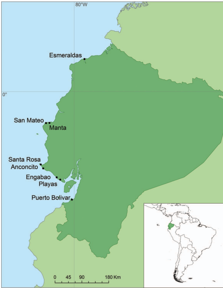
Figure 2. Map of Ecuador’s 8 monitored fishing ports.

catch from 1990 to 1995 (608 t). We then aggregated the small-scale shark catch estimates and the industrial shark catch estimates to obtain total estimates for mainland shark landings.