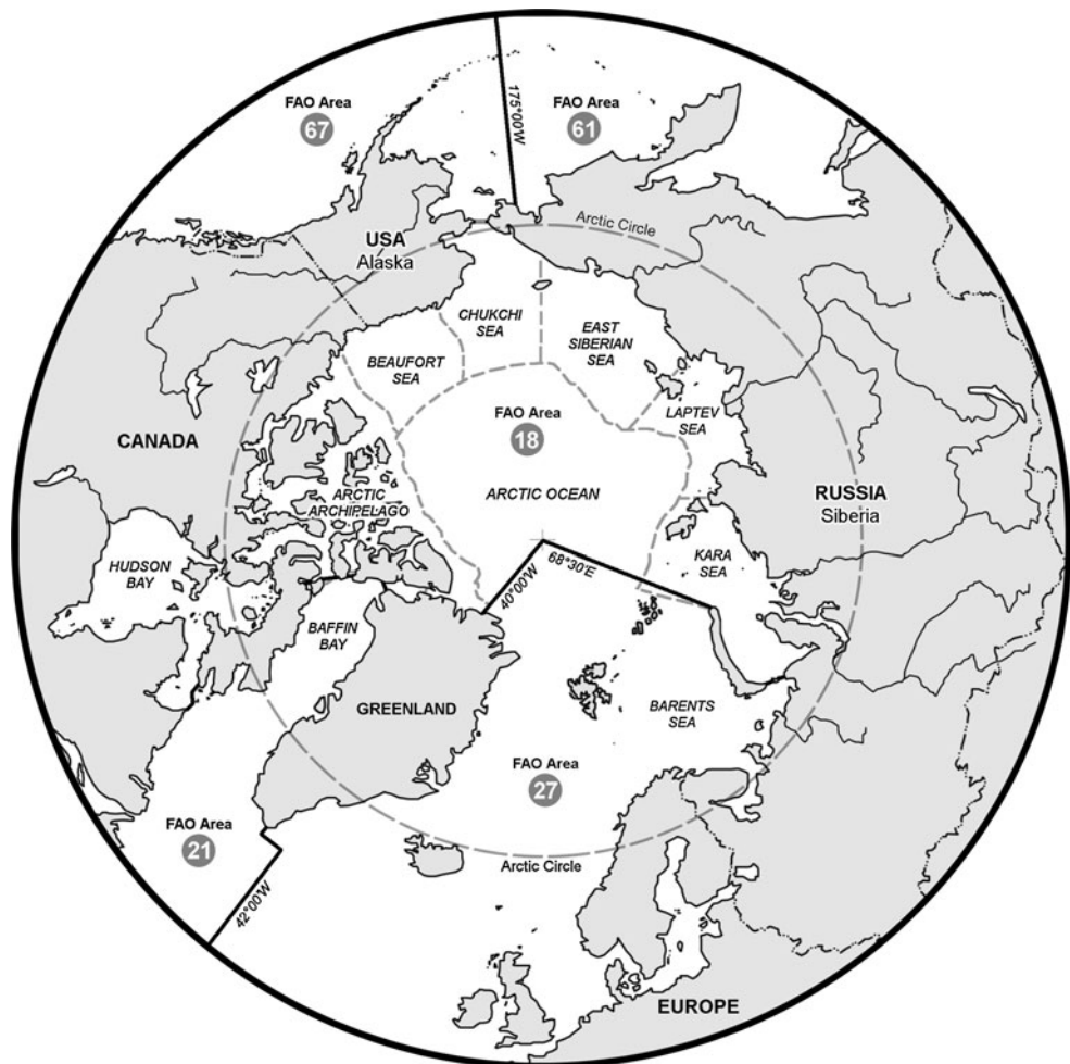
Fig. 1 Map of the arctic region, showing Statistical Areas of the United Nations Food and Agriculture Organization (FAO), as well as the eight Large Marine Ecosystems (LMEs) associated with FAO Area 18 (Amerasian Arctic). Note the purely oceanic nature of the Arctic Ocean LME, which was not included in the present study

permanently covered by ice, and at present not affected by fisheries. Given the focus of arctic fisheries in coastal and estuarine waters, a good comparative reference is catch per Inshore Fishing Area (IFA, Table 1), which is defined as the area of ocean that is within 50 km from shore or 200 m depth, whichever comes first (Chuenpagdee et al. 2006).