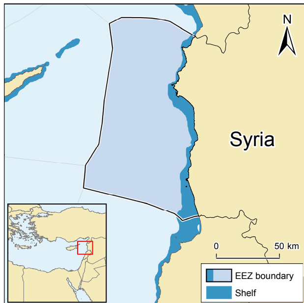
Fig. 1. The Exclusive Economic Zone (EEZ) and shelf area (to 200 m depth) of Syria

Syria borders the Levantine Basin of the eastern Mediterranean Sea, which extends from southern Turkey to Egypt (Fig. 1). The continental shelf is narrow (1–10 nautical miles wide) and measures approximately 960 km 2 , while Syria's Exclusive Economic Zone (EEZ) measures approximately* 10 000 km 2 .