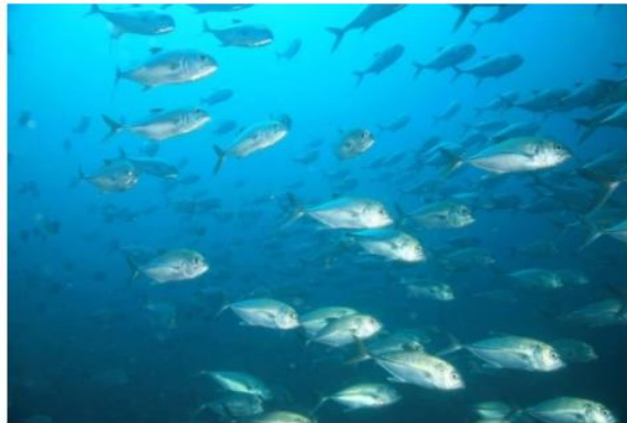
Fish could shrink by up to 30 percent as climate change warms marine habitats.