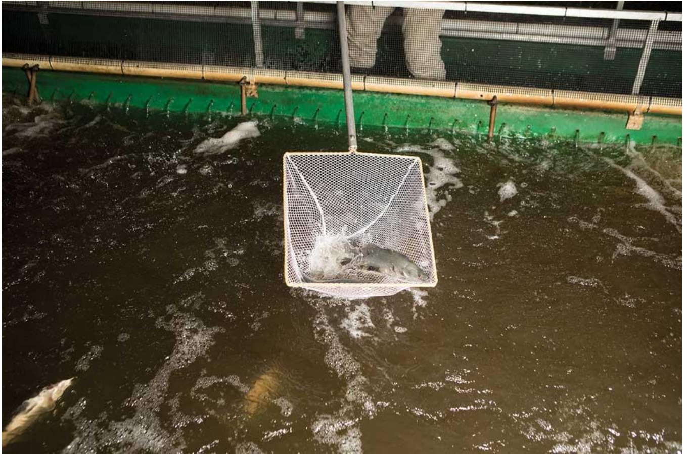
The Nelsons' barramundi live in tanks meant to mimic a riverbed

in the spring that it had developed a feed without fish meal. Other researchers are looking to nut waste, algae, or insect larvae as a replacement.