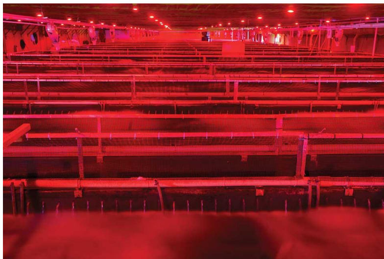
Special lights help the barramundi grow faster.

Driver leads me into a long "grow out" room, which holds two dozen 10,000-gallon tanks painted dark green to mimic the color of a riverbed. Teenage barramundi—11 inches long—cluster under the surface of churning water kept at 82 degrees. Banks of lights put the fish through six sunrises and sunsets each day, a trick to keep them feeding and growing faster. When the lights turn on, they know lunch will drop from plastic containers hanging over the tanks. Pellets made from ground fish meal, chicken byproducts, and wheat are quickly snatched up, helping the barramundi swell from 1.4 ounces to two pounds in mere months, a growth spurt that would take them a year in nature.