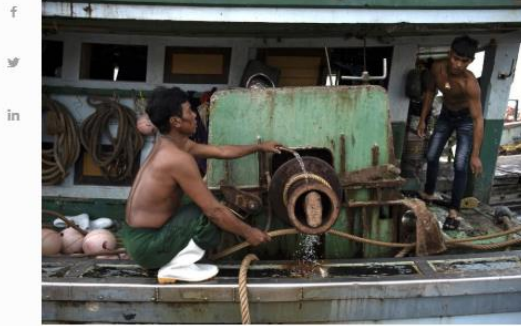
Myanmar migrant workers preparing a fishing boat in the Thai coastal province of Samut Sakhon. A 'mafia' of recruitment agents is trapping Myanmar migrants to Thailand in debt bondage despite a 2017 law meant to fight exploitation in the kingdom's notoriously shadowy job market, activists and workers say. September 20, 2018

Even in so-called "low-risk" countries, such as the U.S. and U.K., consumers are potentially eating lots of seafood that was caught, filleted, and packed by the hands of slaves.