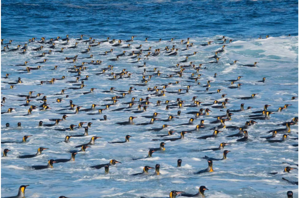
MARION ISLAND King penguins, most returning from hunting at sea, congregate in shore break in Marion Island's Kilda Ikey Bay. The birds normally come ashore in small groups, the better to avoid orcas and other predators. On this day, heavy surf slowed their landing at the beach, leading to a rarely observed traffic pileup.

Another promising technological advance is the Hookpod , which consists of a hard plastic case that snaps around a baited hook, protecting the bait from birds and birds from the hook, and doesn't spring open until it has sunk to a safe depth. It is theoretically possible, by making the Hookpod standard equipment on all longline vessels, and by requiring all trawlers to run bird-scaring lines, and by simply banning gill net fishing (as South Africa has done), to render the world's oceans safe for seabirds. For now, though, the global situation remains atrocious. Wanless and Angel have expanded their outreach to the fisheries of South America, Korea, and Indonesia, with not altogether discouraging results, but the fleets of China and Taiwan, which together account for two-thirds of fishing vessels on the high seas, operate with little or no regard for seabird mortality, and they sell their catch in markets mostly indifferent to sustainability.