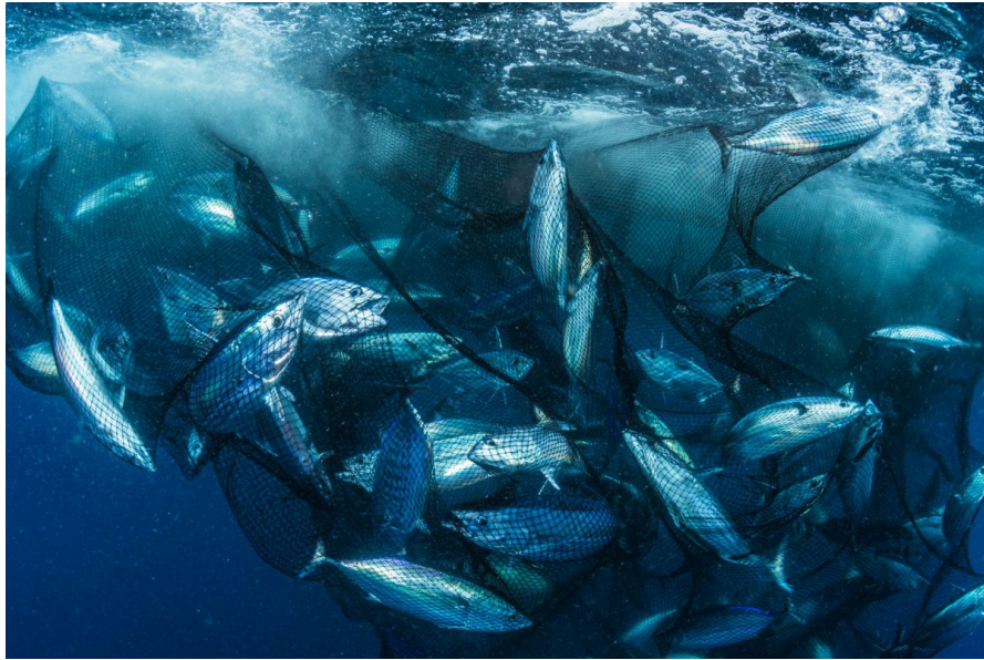
This school of skipjack tuna was caught in a purse seine off the coast of North Sulawesi.