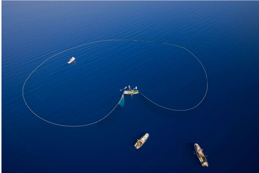
Most tuna are caught using purse seines. In this method, a large net deployed around a school of fish is “pursed” on the bottom to prevent the fish from escaping.

Most of the skipjack caught in the WCPO today is harvested by purse seining, an industrial fishing method in which dense schools of fish near the surface are encircled with a large net and scooped out of the ocean. Beginning in the early 1950s, fleets from the United States, Korea, and Taiwan were the primary tuna purse seiners in the Pacific, but by the 2000s, vessels from China, Ecuador, El Salvador, New Zealand, Spain, and the Pacific Islands became active, too.