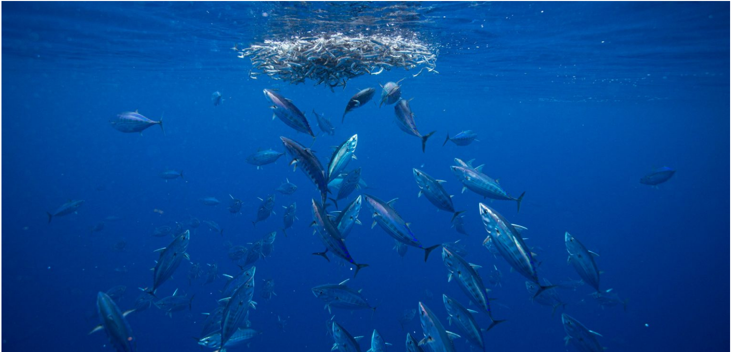
A school of skipjack tuna feeds on northern anchovy.