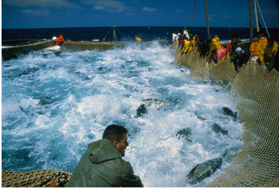
Fishermen raise a net full of Atlantic bluefin tuna near Sardinia, Italy.

But despite their remarkable resilience as fast-growing breeding machines, some researchers are warning it's only a matter of time until skipjack, representing one of the planet's last great oceanic biomasses, are fished into decline in a way similar to the cod of Newfoundland or any number of bigger tuna species in the Atlantic and Indian Oceans.