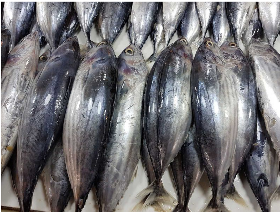
Skipjack tuna at a fish market in the Philippines

The world's most abundant tuna is resilient, but can the fish outswim our demand?