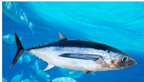
Albacore tuna is one of several species of finfish caught in B.C. that are MSC certified.