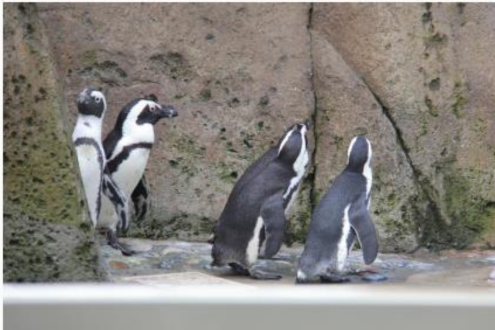
The Vancouver Aquarium has six endangered African penguins.