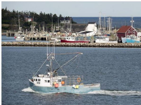
A fishing boat heads out the harbour in Yarmouth, N.S., on June 15, 2016.