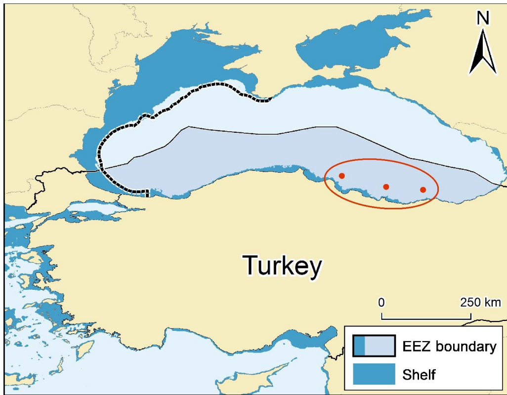
Fig. 1: Regions from which the fishery catches used in this study originated. The 3 dots in the Southeast Black Sea document the three points whose SST values were averaged to obtain a SST trend characterizing the core area of Turkish fisheries in the Black Sea. The dotted line separates what Shapiro et al. (2010) call the colder “deep Black Sea” from the warmer “Western shelf” of the Black Sea.

The Turkish catches from these two areas consisted of N = 88 species and/or higher taxa (henceforth ‘species’) for which trophic levels and preferred temperatures were available or could be inferred (Table 1a for fishes and Table 1b for invertebrates in Supplementary Material), as required for the calculation of the MTI and MTC indices.