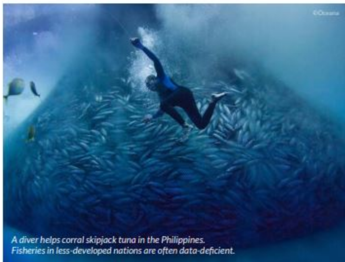
A diver helps corral skipjack tuna in the Philippines. Fisheries in less-developed nations are often data-deficient.

Classical stock assessments, therefore, are not only extremely expensive — a research vessel survey lasting a week can cost several hundred thousand dollars — but also very demanding in terms of data and expertise. Thus, they are performed mainly in wealthier countries.