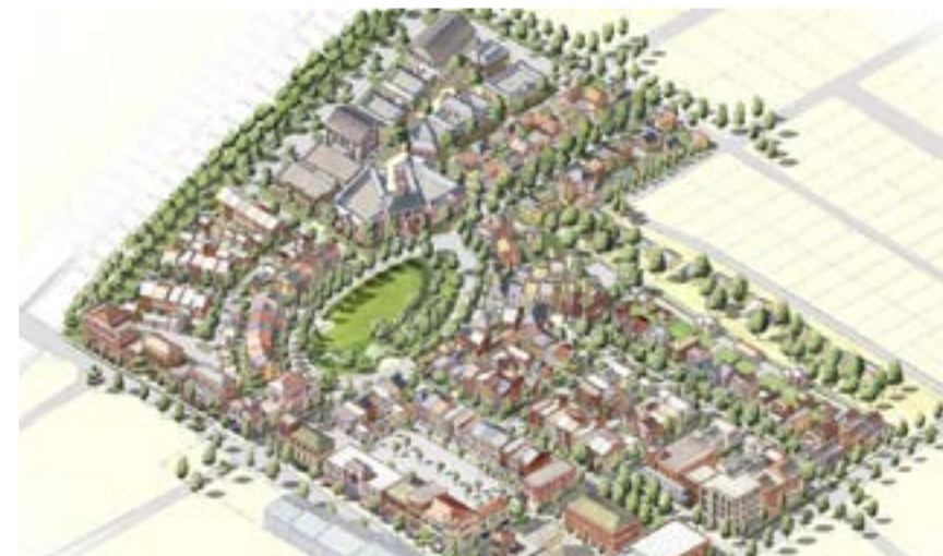
GLENWOOD PARK Site plan for Glenwood Park, an infill district in Atlanta, Georgia.