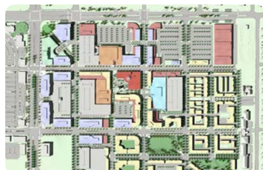
Site plan showing grid network – Belmar, Lakewood, Colorado.