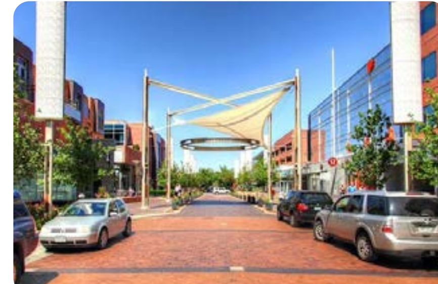
Festival Street – Fillmore Plaza, Cherry Creek North, Denver