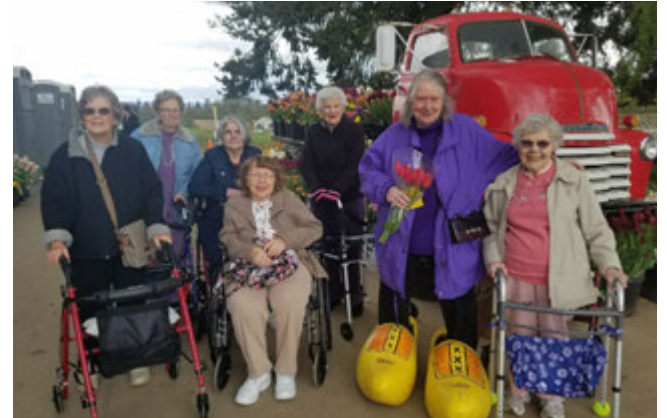
Everyone is all smiles!