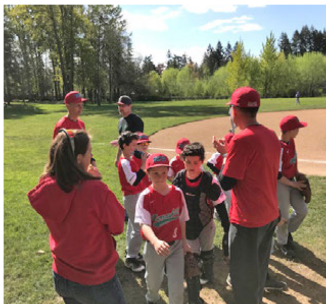
Red Falcons getting ready to bat!