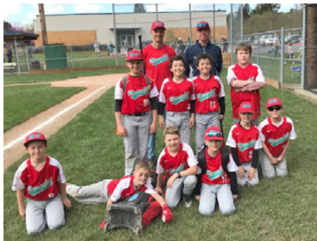
Canfield is sponsoring the Red Falcons this season.