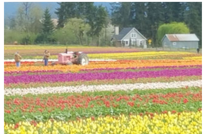
A field of color!