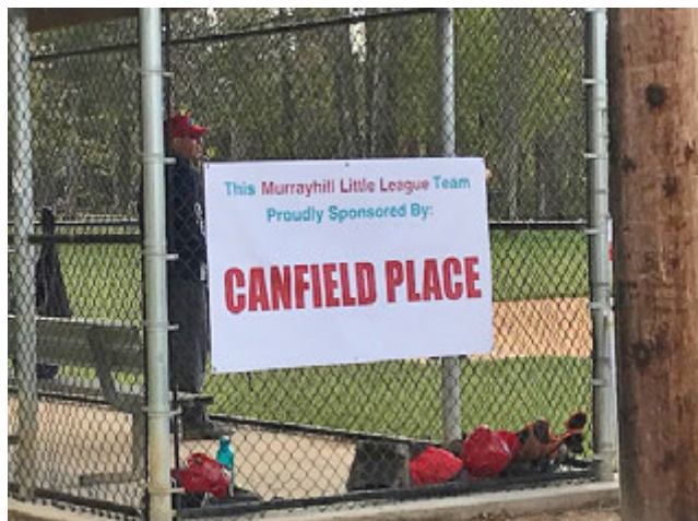
Canfield's banner on proud display!

On the Little League side of things, Canfield Place, for the very first time ever, has sponsored a local team called the Red Falcons. They are a group of 10, 11 and 12 year olds playing against five other teams in a three month season during April, May and June. The coaches are all dedicated volunteers. We are looking forward to arranging a trip to see a game as one of the upcoming resident excursions. Stay tuned!