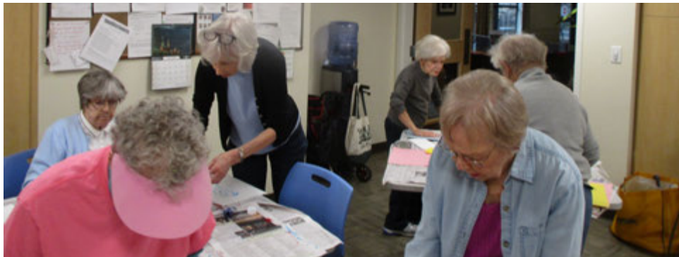
Artists at Work