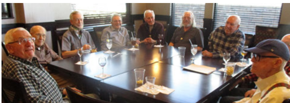
Suds & Buds