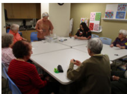
Fused Glass Art Workshop