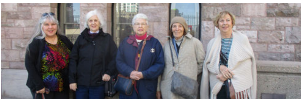
Trinity Methodist Tour