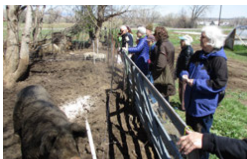
Cure Organic Farm Tour