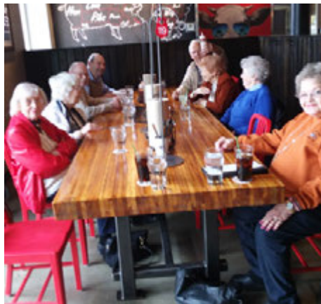
This great group enjoyed lunch at Blackbird.