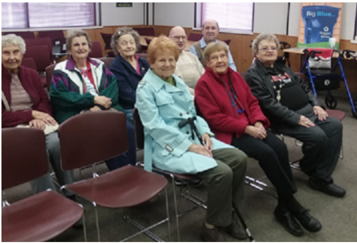
One of our outings in April was to the Spokane Waste-to-Energy Facility. It was a very informative tour.