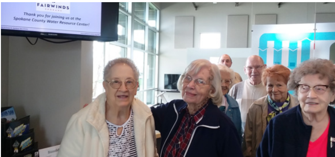
We received a warm welcome at the Water Resource Center.