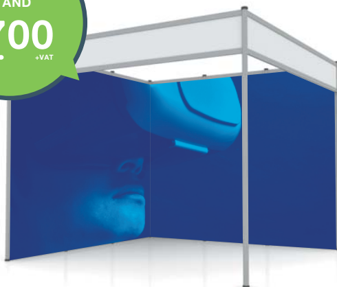
3X2m Seamless - CORNER