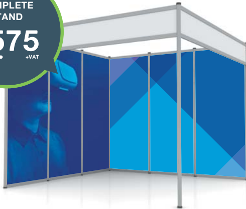
3X2m Standard - CORNER