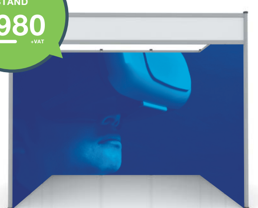
3X2m Seamless - MIDDLE