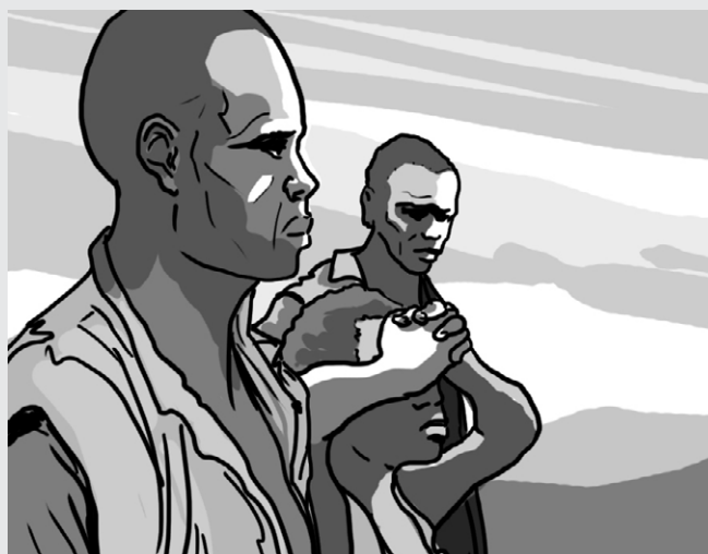
Video shown during the opening statement, ICC v. Lubanga